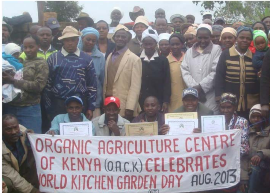
The Organic Agriculture Centre of Kenya, a 2013 Sow It Forward grantee, graduates a new class of certified organic gardeners on World Kitchen Garden Day