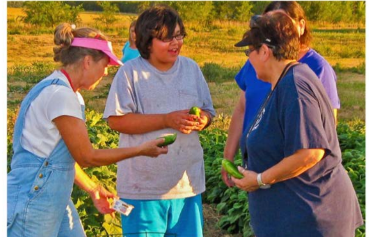
A tribal organization in Nebraska uses its Sow It Forward grant to reconnect its people with their agricultural roots