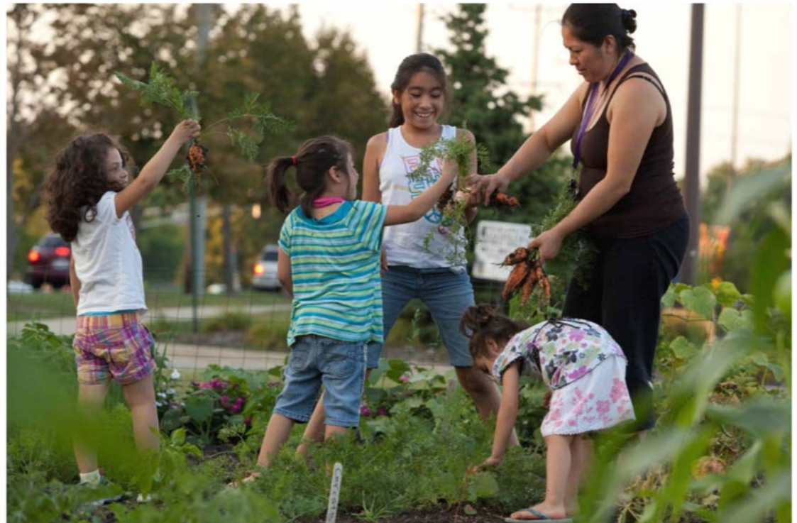
Roots Community Garden of Palatine, Illinois sows its garden grant forward between generations

32,000 people in the KGI network. 25,000 facebook fans. 1,200,000 total video views on our YouTube channel. 80 Sow It Forward Grants awarded reaching 24,000 gardeners in need and growing 40 tons of healthy food for hungry communities.