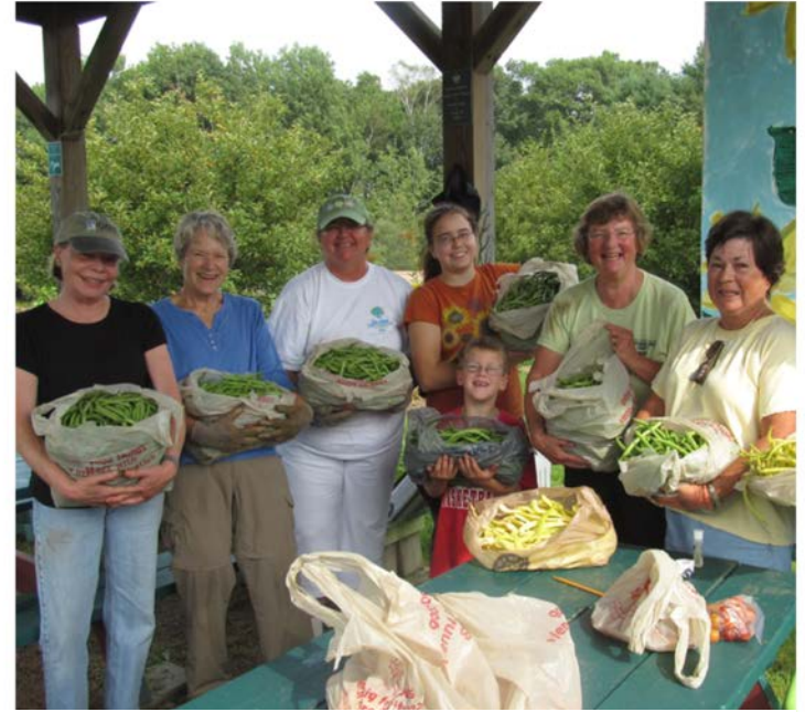
The Yarmouth Community Garden of Maine sows its garden and grant forward by donating fresh produce to a local food bank